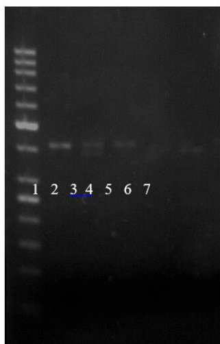
Fig. 3: Analysis of the variable number of tandem repeats (VNTR) polymorphism in intron 4 of the eNOS gene. The 420-bp band indicates five 27-bp repeats, and the 393-bp band indicates four 27-bp repeats. Lane 1: 50 bp DNA Ladder Lane 2, 3 4b/4b, Lane 5, 6: 4a/4a Lane 3: 4b/4a