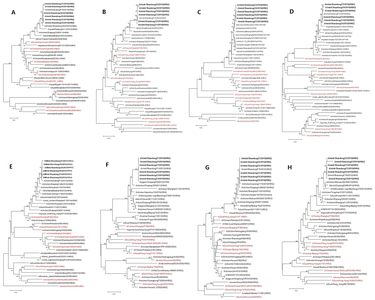
Figure 1. Phylogenetic trees of all eight segments of H9N2 IAVs isolated from the mink. Phylogenetic trees were constructed using MEGA 6.0, and the reliability of the tree was evaluated by the bootstrap method with 1,000 replications. The black bold sequences represented the H9N2 IAVs isolated from the mink, the red sequences represented the reference strains. (A), HA; (B), NA; (C), PB2; (D), PB1; (E), PA; (F), NP; (G), M; (H), NS.

(31.0%) serum samples from mink were positive for anti-H9 antibody and the HI titers were 16–1024. 76 of 128 (59.4%) serum samples from foxes were positive and the HI titers were 16–2048. 106 of 256 (41.4%) serum samples from raccoon dogs were positive and the HI titers ranged from 16 to 64. The serum samples were negative for anti-H1 antibody.