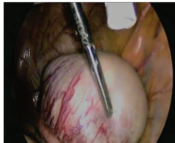
Figure 2: Laparoscopic oophorocystectomy for the ODC. ODC = ovarian dermoid cyst