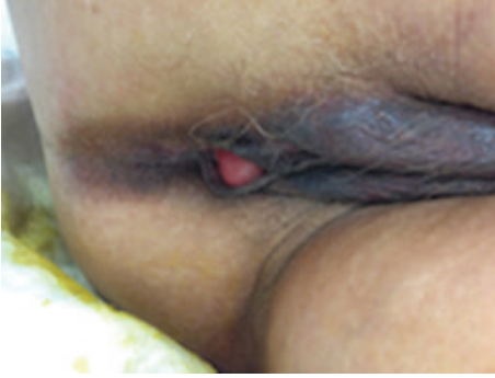
FIGURE 1: Examination demonstrating congenital absence of external anus. The rectovestibular fistula is just visible at the posterior aspect of the introitus near the fourchette.