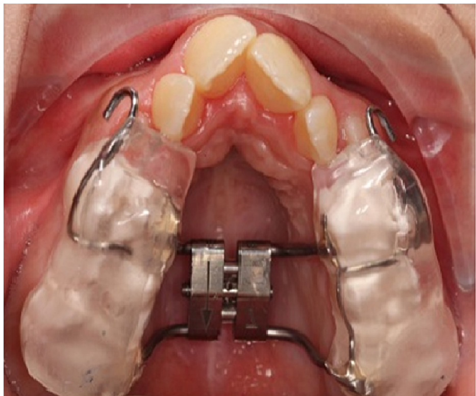
FIGURE 2: Bonded palatal expander