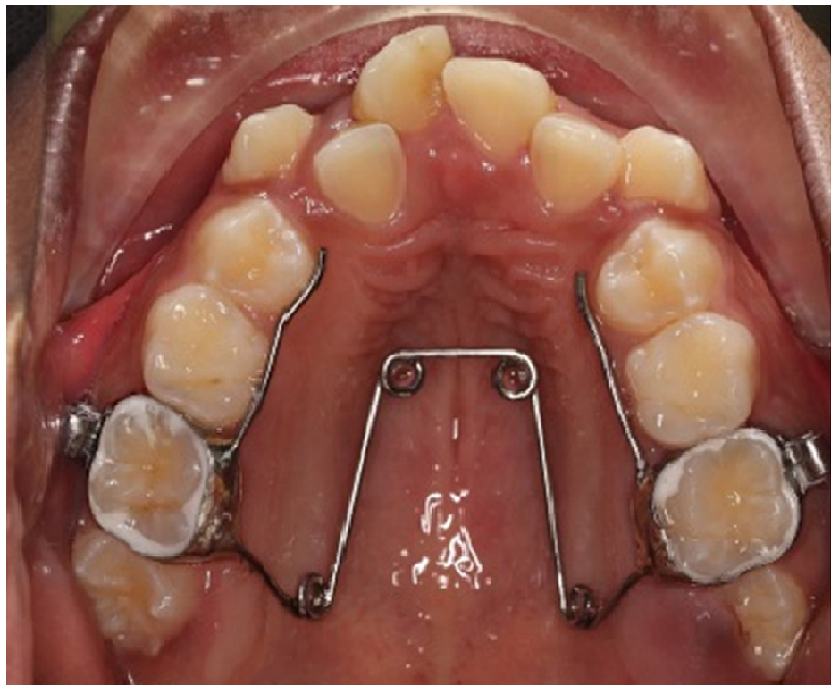
FIGURE 1: Quadhelix expander

Assessments of skeletal maturity have been proposed, among them cervical vertebral maturation, hand-wrist radiographs, and more recently using CBCT to assess maxillary sutural maturity [38]. The appliances used to carry out orthopedic expansion are generally categorized into two types: tooth- plus tissue-borne expanders and tooth-borne rapid palatal expanders, both of which can be bonded (Figure 2) or banded to teeth. There remains a debate as to which of these two yields greater skeletal expansion, but both have been