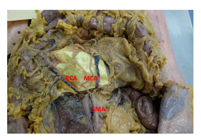
Fig. 3 Right colic artery (RCA) arising from the root of the middle colic artery (MCA), i.e. before it bifurcates to give a left and right branch. SMA superior mesenteric artery (permission for reproduction granted by the Annals of the Royal College of Surgeons of England)

modern surgical techniques by their very nature are demanding an increasingly precise understanding of the relevant anatomy in order that more advanced operations may be performed effectively [13, 14, 22]. In the context of CME, by determining the exact origin of the right colic feeding vessel a high vascular tie and complete lymphovascular resection may be performed, resulting in an oncologically superior resection. A consistent method of describing the anatomy of the RCA will also aid in the generalisability and translation of future research into clinical practice. This notion of precise anatomical understanding is evident not only in CME for colon cancer, but also in fields as diverse as scaphoid reconstruction, hip arthroplasty, cochlear implantation and cervical cancer surgery [28–31].