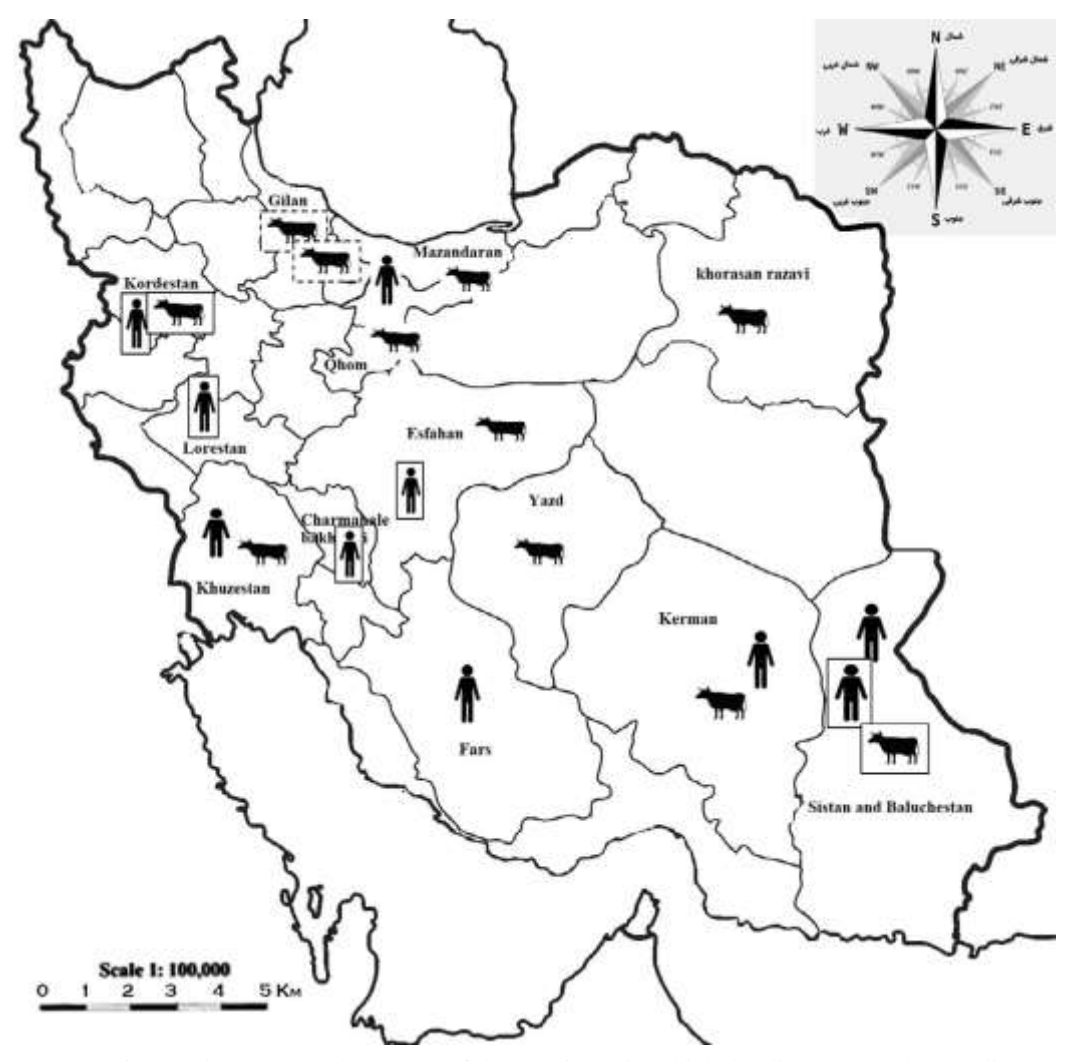
Fig. 3. Iran map by its provinces. Only the names of the provinces in which the disease sample was discovered are mentioned. The human and animal symbols are representative of the discussed infections in with picture border, without picture border and dot picture border for Tularemia, Q fever and Lyme respectively.

The Caspian Sea in Iran is the habitat for various hard tick species like I. ricinus , the notorious vector of Lyme borreliosis (LB). Ixodes ricinus and other hard ticks were examined, along with small mammals and common rodents for LB (Fig. 3). The ticks were collected from different mammalian hosts, including camels, sheep, dogs, goats,