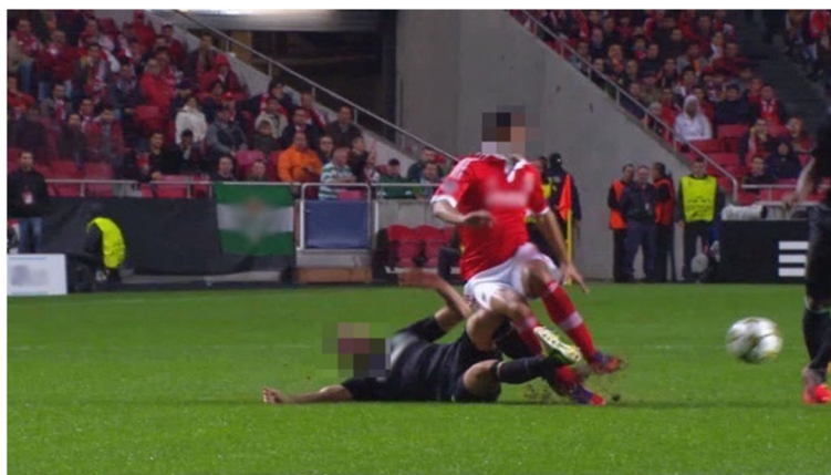
Fig. 1 Example of a foul-play situation for which the referees had to make a disciplinary decision (no card, yellow card, or red card)

For all analyses, we used the R statistical programming language (version 3.3.2) and RStudio (an IDE for R, version 1.0.136). For data processing, we relied on the tidyverse package (Wickham, 2017) and for data visualization we