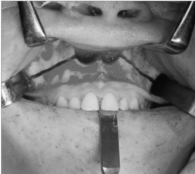
Figure 2. Maxillary Le Fort I osteotomy.