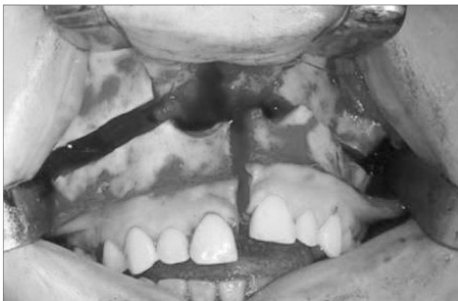
Figure 3. Vertical osteotomy leading to sagittal division of the maxilla.