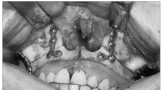
Figure 5. Maxillo-mandibular block and internal rigid fixation.

The Research Ethics Committee of our institution judged and accepted this paper (protocol number CEP/ UPE: 038/08).