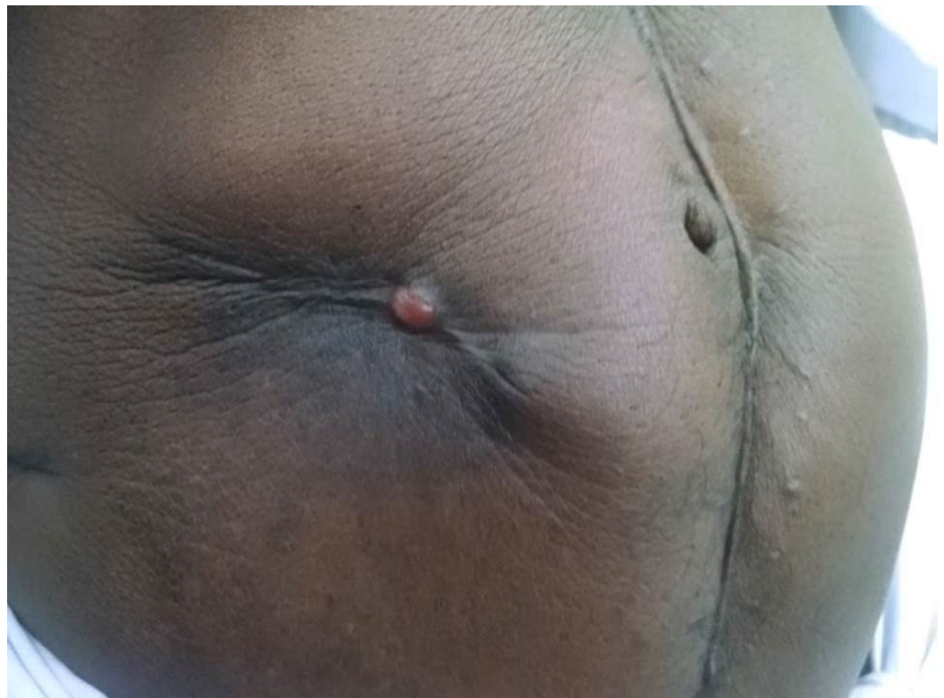
FIGURE 2: Purse-string skin closure scar three months post-stoma closure surgery

In our study, the sum of the observer scores and patient scores were taken as the 'total score' of the POSAS and were compared between the two groups to assess the difference in the scar outcome. Patients were assessed for scar cosmesis at four and 12 week follow-up periods (Figure 2).