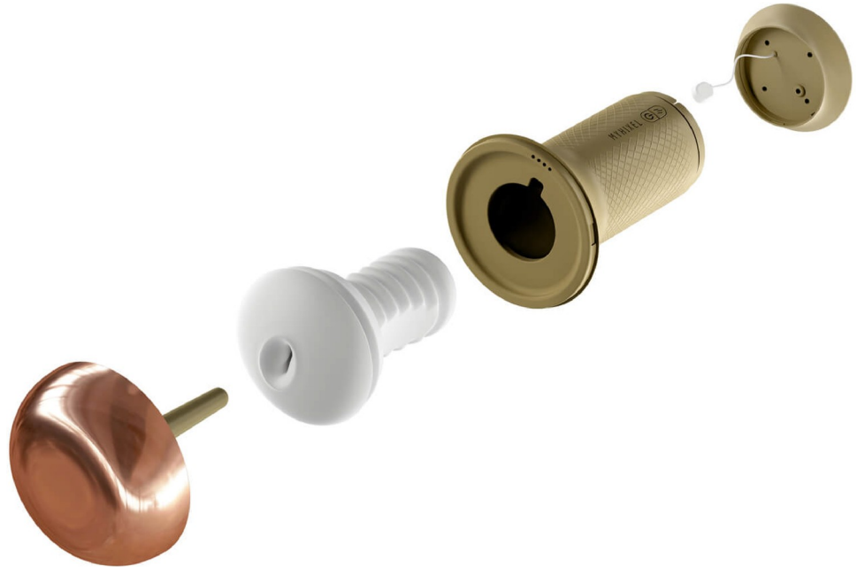
Fig 1. Device MYHIXEL I. International patented device SKU MX_PA_000. EAN 8437019695019. Dimension length: 113 mm. Width: 113 mm. Height: 203 mm. Diameter 91 mm. Weight 630 grams. Materials: thermoplastic elastomer, ABS silicone. Type of battery Lithium. Charger type, USB + Magnet (Waterproof).

https://doi.org/10.1371/journal.pone.0257284.g001