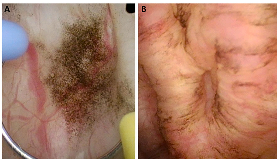
Fig. 2. A and B. Multiple black and brown pigmented lesions in the bladder during surgery. (For interpretation of the references to colour in this figure legend, the reader is referred to the Web version of this article.)

Pseudomelanosis of the bladder is an extremely rare entity with only a few cases reported worldwide. Histopathological examination is essential in diagnosing this condition. Although considered benign, follow up with cystoscopy is recommended by several authors.