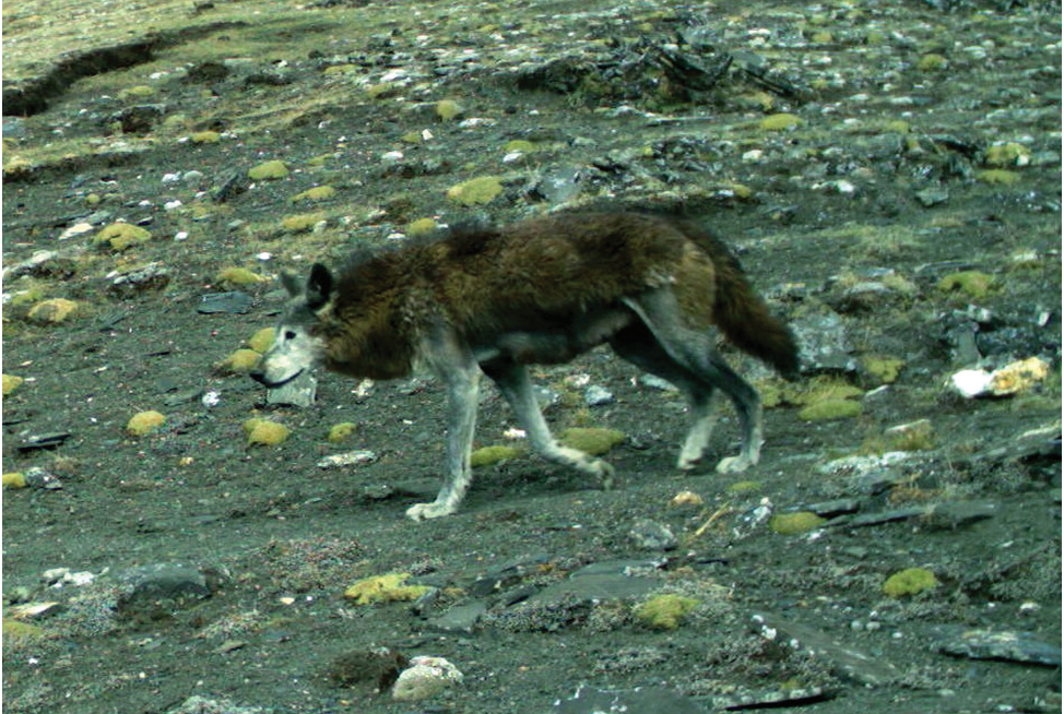
Figure 1. A Himalayan wolf photographed in Upper Mustang of Annapurna Conservation Area, Nepal (29.17356°N, 84.13422°E; datum WGS84, elevation 5,050 m) during May 2014.

China, Mongolia and Russia, and falls under the widespread wolf-dog clade. On the other hand, the basal monophyletic Himalayan wolf mtDNA lineage of C. l. chanco is distinct from haplotypes in the wolf-dog clade, and is likely distributed from eastern Kashmir into eastern Nepal and Tibet.