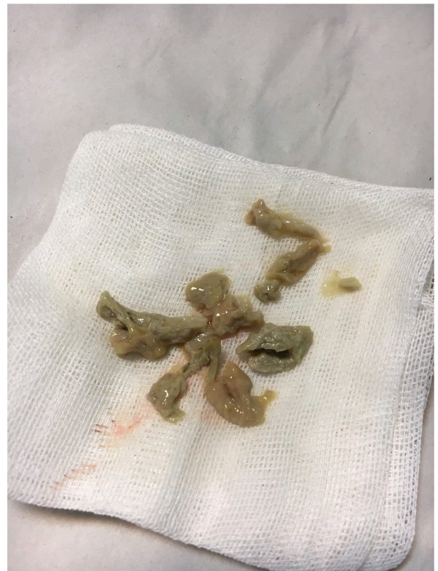
Fig. 3. Massive meat after extraction.

formation, hemoptysis and bronchiectasis. In the index case, the child had asthma like symptoms for about four months. She received medications for asthma but the symptoms remained and progressed. In her