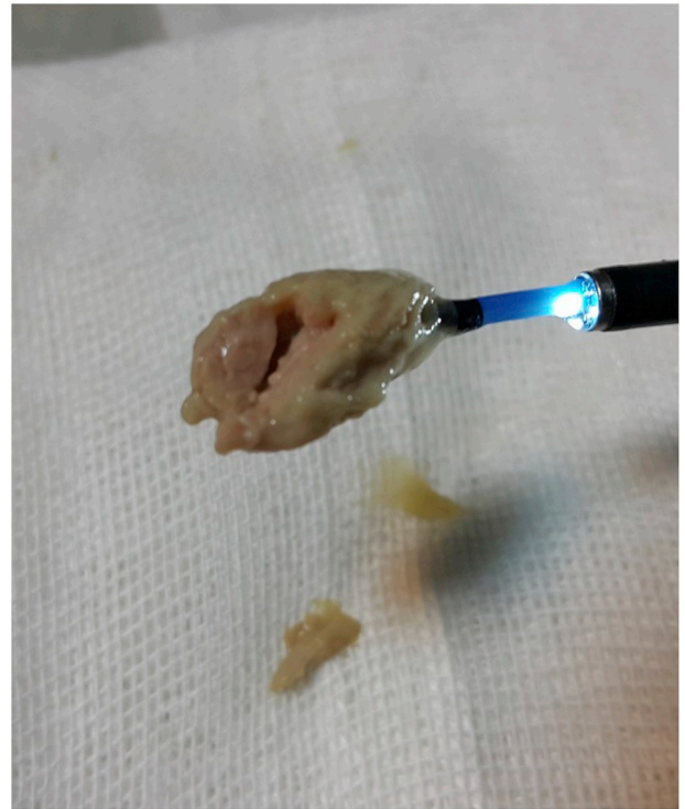
Fig. 2. Flexible bronchoscope with cryoprobe and the adhered foreign body (Meat).

Foreign body aspiration (FBA) into the larynx, trachea and bronchi can cause a lot of morbidity and mortality by obstructing the airways and disrupting the oxygenation and ventilation. The classic presentation triad of choking, persistent cough, and unilateral wheezing or decreased air movement in one side are seen in many patients with FBA. An accurate history of an acute choking episode followed by coughing or wheezing is helpful in the establishment of an FBA diagnosis. Retained FBs and delayed diagnosis of FBA specially in pediatric age groups can account as one of the most challenging problems for interventional bronchoscopist and may result in chronic wheezing, persistent cough and serious complications such as pneumonia, atelectasis, abscess