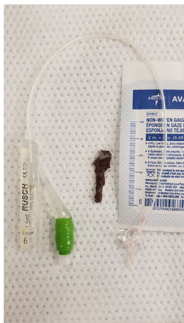
FIGURE 3 Extracted foreign body from Example 2 and demonstration of the size of the inflated pediatric foley catheter balloon are shown