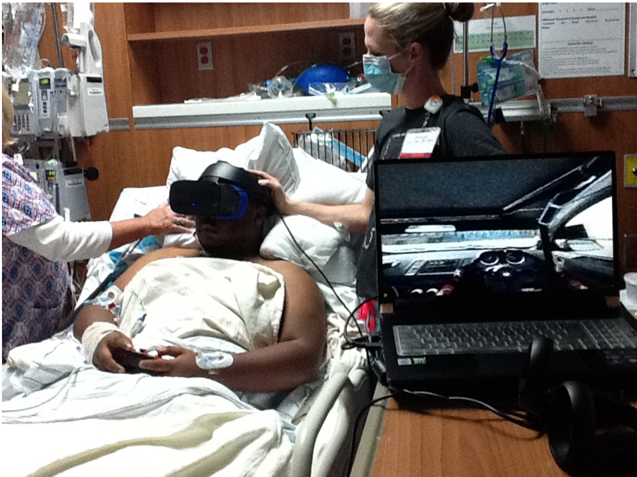
Figure 3. Demonstration of virtual reality racing in the pediatric intensive care unit.

In session 3 (October 28, 2020), case 1 completed 6 minutes of moderate-to-vigorous intensity exercise in a boxing game ( Thrill of the Fight ) using WalkinVR. Before starting the session, the therapist found that case 1's foot was pressed against the bedframe and resolved the issue before play. Using WalkinVR, the interventionist provided case 1 with physical boost to his arm movements, adjusted the player height and arm positions, and moved the player avatar with an X-box controller during gameplay. The interventionist also moved case 1's player avatar