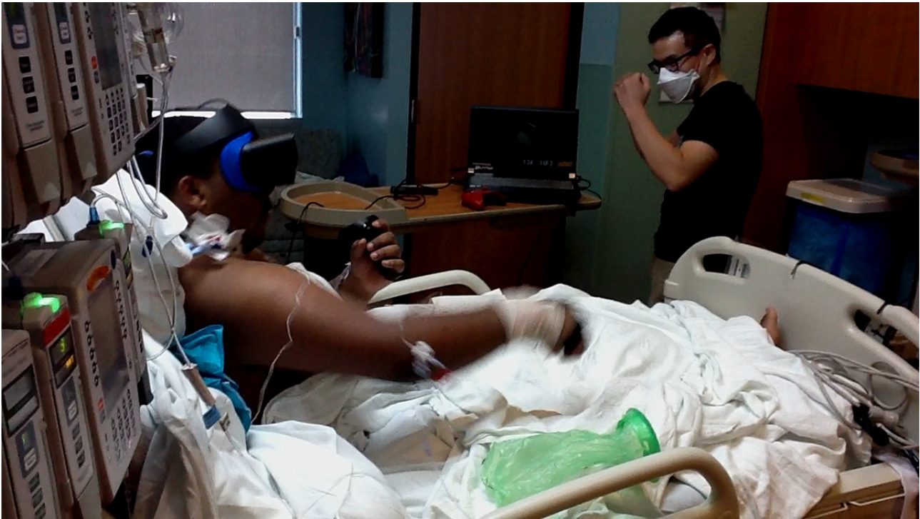
Figure 4. Demonstration of virtual reality boxing in the pediatric intensive care unit.

In session 4 (November 3, 2020), case 1 completed 30 minutes of play. Case 1 had not undergone a VR session for several days because of pain due to rhabdomyolysis. Case 1 was feeling much better than his last session. He was ambulatory, conversive, and had a positive affect. He was transferred to an acute care floor of the hospital. He chose to play the games in a lounge area of the hospital floor and was connected to an intravenous drip during play. Setup took 10 minutes. Case 1 played Thrill of the Fight and Beat Saber . He played 2 rounds of boxing and required very little physical boost in WalkinVR . He played 3 rounds of Beat Saber , with high success in box chopping. He tried the easy and hardest level of difficulty and was highly engaged in the play. Case 1's movements were very dynamic and near full range of motion. He reported that he was playing at a moderate intensity, as indicated by his breathing rate and a verbal rating of perceived exertion of 6 on a 1-10 scale. Overall, case 1 was exercising for nearly the entire 30-minute session. He was willing to play longer but had another medical appointment that he needed to attend.