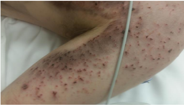
Figure 2. Closeup of patient's left upper arm after explosion of the lithium-ion battery from an electronic vapor cigarette, with superficial schrapnel-like wounds.