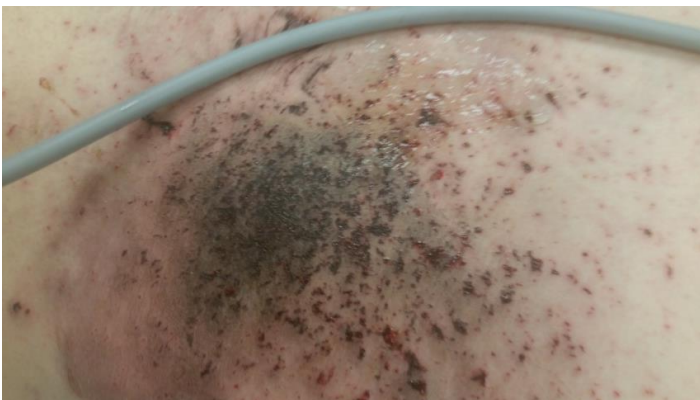
Figure 3. Closeup of patient's left upper quadrant contusion/schrapnel-like injury after explosion of electronic vapor cigarette lithium-ion battery.