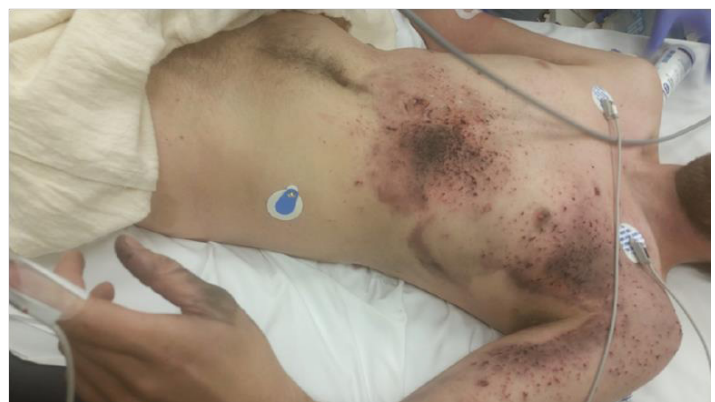
Figure 1. Shrapnel-like superficial skin penetration and contusion from exploding lithium-ion battery from an electronic vapor cigarette.

Accordingly, physicians treating E-cigarette users should advise patients of these risks. From a public health/safety standpoint, the E-cigarette industry should take these risks into consideration during manufacturing and advertising, so as to protect and inform consumers.