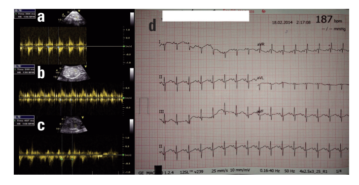
Figure 2. Prior to starting treatment with ivabradine, fetal echocardiography showed a heart rate of 156 bpm (a). On the 1st day of ivabradine treatment, the fetal ECG showed that the fetal heart rate was 150 bpm (b). On the 1st week of ivabradine treatment, the fetal heart rate reduced to 148 bpm (c). After delivery, the mother continued her ivabradine treatment, and the ECG of the baby, who was fed only breast milk, showed sinus rhythm with a heart rate of 180 bpm (d)