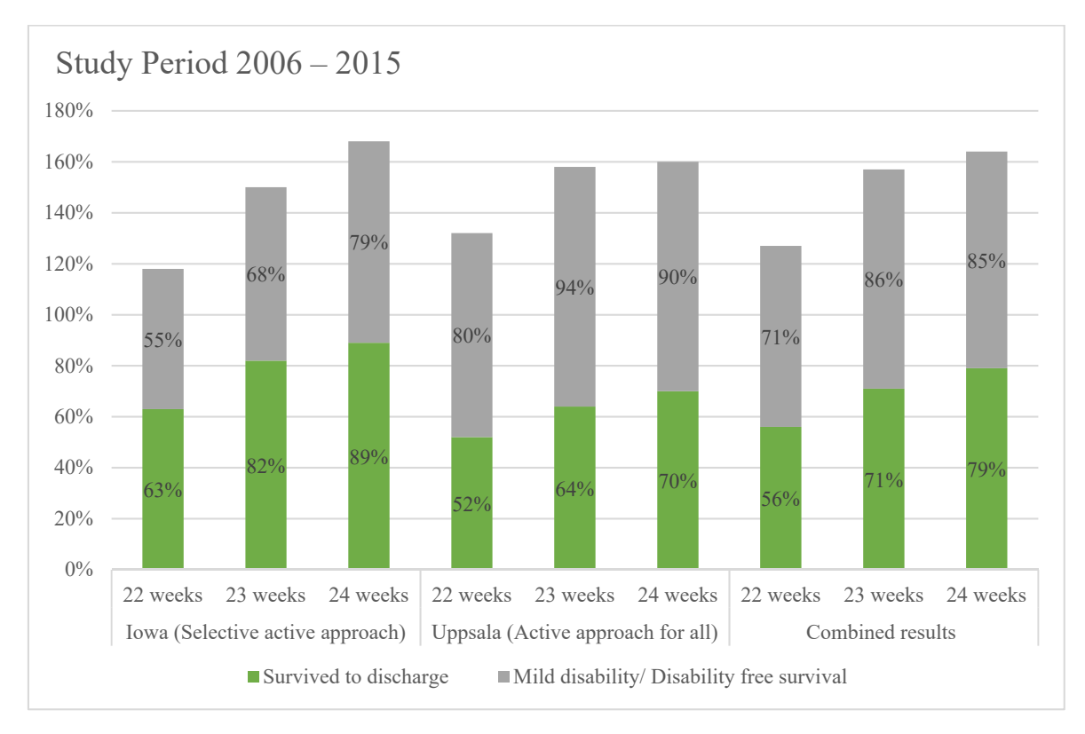
Figure 2. Comparative perspective for outcome at the margins of viability.