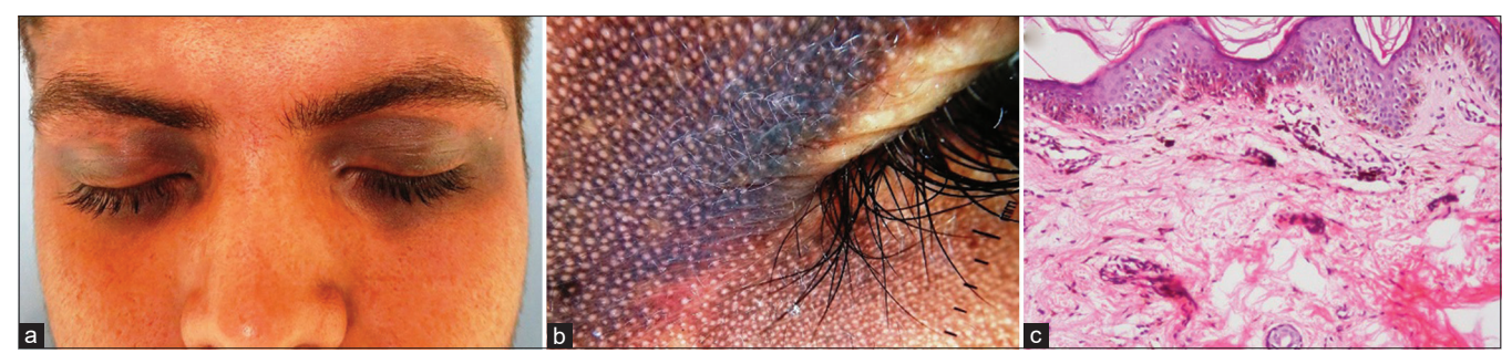
Figure 2: Late periorbital ADMH in a 16-year-old boy. (a) Easily noticeable dark slate gray pigmentation around both periorbital region. (b) Diffuse pattern of dermal pigment structures sparing eccrine openings on dermoscopy. (c) Marked dermal pigment incontinence and dermal inflammation with minimal basal cell changes. (H and E, 100×)

(erythema dyschromicum perstens, EDP). There is a scarcity of literature regarding periorbital ADMH.