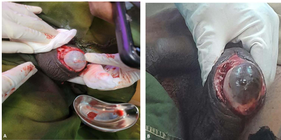
Figure 2 Intraoperative pictures. (A) Doubtful viability of left testis on the first incision and drainage with purulent fluid on the kidney dish. (B) Progressive testicular gangrene after three days of conservative management.