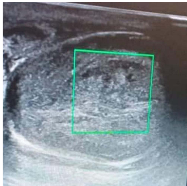
Figure 1 Scrotal Doppler ultrasound showing left testicular infarction with heterogeneous parenchyma and areas of hypoechoic and hyper-echoic changes with no color Doppler flow detected over testicular parenchyma. Diffusely enlarged testicle measuring 4.7×3.2 cm in size. Otherwise, no hydrocele, epididymal, or spermatic chord enlargement noted with normal studies on contralateral testicle.

On subsequent physical examination, skin changes with induration small subcutaneous fluctuant mass were noted but no ulceration on left hemiscrotum and for these incision and drainage of the left testicular abscess was performed. The Intra-operative finding was adhesion between the left testicle and the overlying scrotal skin and approximately 05 mL of thick non-offensive pus was drained, with focal necrotic areas on the anterior surface of the left testicle (Figure 2A). The spermatic cord was normal, with no evidence of torsion. The wound was left open with a saline-soaked dressing to observe further changes in the testes. We followed up the patient in our inpatient urology ward with wound care on a twice-daily basis, scrotal elevation, and antibiotics for 72 hours. However, necrotic changes and discoloration of the left