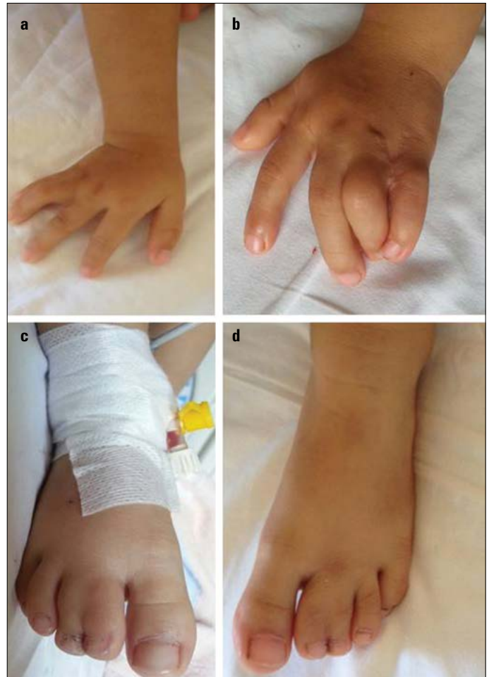
Figure 1. a-d The two-and-a-half-year-old female patient was observed to have syndactyly between her 4 th and 5 th fingers and 2 nd and 3 rd toes

The female patient at the age of two-and-a-half years was referred to us because of the development of CA and the performance of short-term resuscitation during surgery for IH and syndactyly. According to the physical examination, her weight was 10 kg (<3.p) and height was 80 cm (<3.p). She had physical and neuro-motor development retardation. The patient had a slightly dysmorphic-looking face and syndactyly between the 4 th and 5 th fingers and 2 nd and 3 rd toes (Fig. 1). According to her cardiovascular examination, she had bradycardia; her peak heart rate was 45–50/min and blood pressure 105/60 mm Hg. She had a 2/6 systolic murmur over the mesocardiac, and her femoral pulses were bilaterally palpable. All other system examinations were unremarkable was normal, and she had an LQTc interval (QTc: 696 ms) and a 2:1 AVB, and T wave alter-