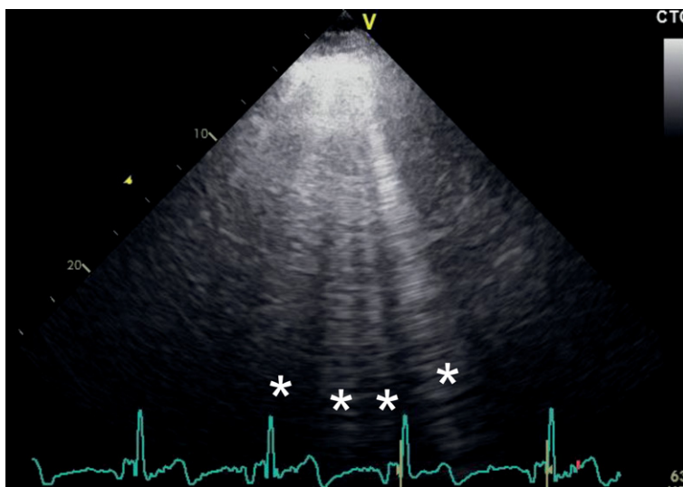
FIGURE 2. B-lines or “comet tails” (*) arising from the pleural line and spreading up to the edge of the screen representing excess of extravascular lung water in one of the patients with severe preeclampsia included in the study.

was 31 years (range 21–44 years); median maternal pre-pregnancy body mass index was 23 kg/m 2 (range 19–32 kg/m 2 ), and median gestational age at study inclusion was 32 5/7 weeks (range 22 3/7–39 4/7 weeks). Twenty-three (77%) patients were nulliparous. Severe features of preeclampsia meeting the inclusion criteria were: hypertension in all 30 cases, headache in 14 (47%) cases, visual disturbances in four (13%) cases, elevated liver enzymes in 10 (33%) cases, thrombocytopenia in three (10%)