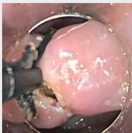
► Video 1 Complete procedure for cricopharyngeal myotomy with the Clutch Cutter.

was stopped immediately during the procedure through coagulation with the closed CC. Mean hospital stay was 3 days (range 2–4 days). All patients had symptomatic relief after myotomy with the CC, and a single patient experienced a diverticulum recurrence 10 months after the initial myotomy which was then successfully treated with a second diverticulotomy using the CC.