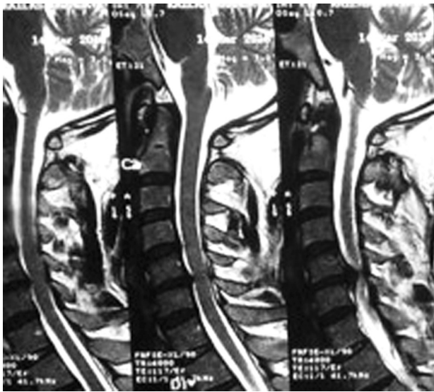
Fig. 1. Grade 0 signal intensity change.

T2-weighted sagittal MR images for SI as follows: grade 0-no signal change (Fig. 1); grade 1-obscure/diffuse signal (Fig. 2); and grade 2-sharp focal signal of the same intensity as cerebrospinal fluid (Fig. 3). Classification of T2-weighted MRI SI changes has been used in various studies to date [18,19]. A similar classification was used in this study, and all T2-weighted sagittal MR images were analyzed for intramedullary cord SI changes by an indepen-