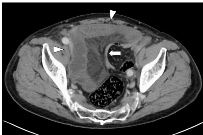
Fig. 2. Computed tomography of the pelvis showed dilatation of the small bowel (white arrowhead) and decompressed distal bowel (white arrow).

The laparoscopic observation indicated that the small bowel was strangulated by bands formed by fatty appendices of the sigmoid colon (Fig. 3a). When the bands formed by the fatty appendices of the sigmoid colon were resected, the V-Loc™ came out from inside (Fig. 3b). The