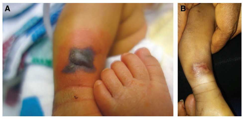
Fig. 3. A, A 5-day old full-term neonate with an R lower leg IV extravasation; dopamine and PPN were infusing. Treated initially with phentolamine and elevation. B, 30-day Status post healing by secondary intention, with residual cosmetic skin changes.