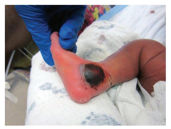
Fig. 5. A 3-month-old infant with a TPN infiltrate 1 week post infusion. Treated with hyaluronidase and elevation.