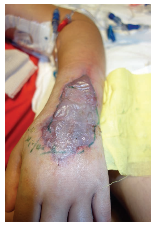
Fig. 1. A 11-year-old female with dopamine extravasation 5 days post infusion. Treated with warm compress and phentolamine.