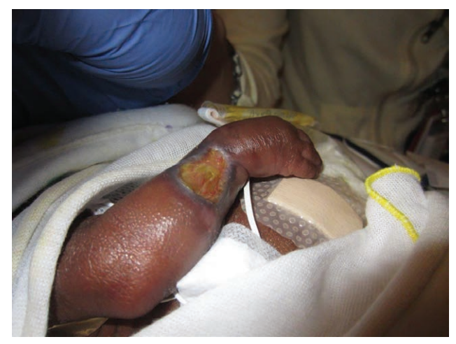
Fig. 2. A 32-week premature infant with a dopamine extravasation 2 months post infusion.

Vasoconstriction occurs via an \alpha -1–mediated response, with norepinephrine being the most commonly reported cause of vasopressor-mediated infiltration.<sup>14</sup> Dopamine and epinephrine ( \beta -1, \beta -2, and \alpha -1 agonist) also function on \alpha -1 receptors. Phentolamine may serve as a local therapy/reversal agent in these cases<sup>23,24</sup> (Figs. 2, 3). In a study of 734 patients receiving peripheral intravenous vasopressors, there was a 2% incidence of infiltration.<sup>25</sup> In all cases, local phentolamine was injected in addition to application of a nitroglycerin paste, and no patients experienced irreversible tissue necrosis. In contrast, vasopres-