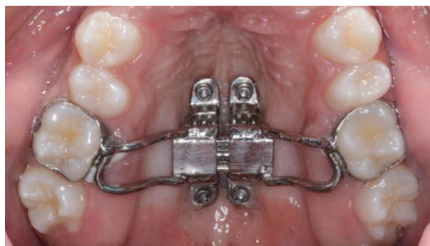
Fig. 1: Hybrid Hyrax Appliance.

Each patient underwent a standardized protocol, and received a maxillary expander (Fig. 1) that was anchored in the bony palate, due to the presence of more atresic palates, using four mini-implants (13) that were supported in bands on the maxillary first molars, installed bilaterally between the projections of the first permanent molars and second premolars at 3mm from the MPS, so that they remain parallel to the MPS (14,15).