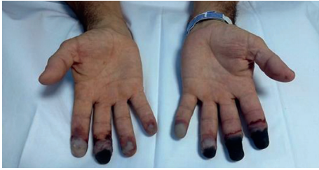
FIGURE 1: Necrotic lesions on the distal phalanges.