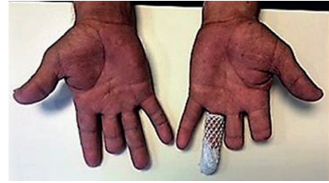
FIGURE 2: Resolution of necrotic lesions after 3 cycles of ABVD protocol (3 months from the HL diagnosis). Amputation of three phalanges was required.

showed hemoglobin 113 g/L, hematocrit 42%, total white cell 18.3 \times 10^9/L , lymphocyte count 4.8 \times 10^9/L , platelets 280,000/mm^3 , and albumin 2.4 g/dl. Electrolytes, liver function, lipidic profile, and serum protein electrophoresis (SPEP) were normal. Results of coagulation test were also normal. Serum complement levels and serologic test for rheumatoid factor, antinuclear, antineutrophil-cytoplasmatic, lupus anticoagulant, anticardiolipin, anti-B2 glycoprotein 1, cryoglobulins, and cryoagglutinins were negative. Hereditary thrombophilia was not evaluated. Human immunodeficiency virus and hepatitis B and C viruses were negative. Arteriography of upper limbs demonstrated a distal stop in all bilateral digital arteries. Transthoracic echocardiogram was normal. He was initially treated for 10 days with anticoagulation with low-molecular-weight heparin, antiplatelet agents such as acetylsalicylic acid at 100 mg once daily and nifedipine, without improvement of ischemia.