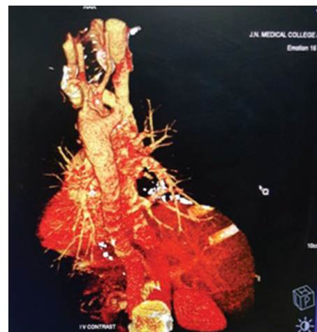
Figure 4: Three-dimensional reconstruction of available contrast-enhanced computed tomography chest showing origin and course of aberrant right subclavian artery (white bold arrow). There was no Kommerell's diverticulum