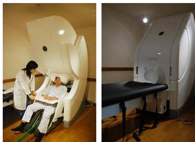
Fig. 1. Photographs of Vectorview (Elekta Neuromag Oy), helmet-shaped, 306-channel, whole-head neuromagnetometer installed in a magnetically shielded room at Seoul National University magnetoencephalography Center. The examination can be performed with the patient in a supine or a sitting position.

Although the magnetic field flux generated by an electrical current is detected by MEG, the specific electrical activity pro-