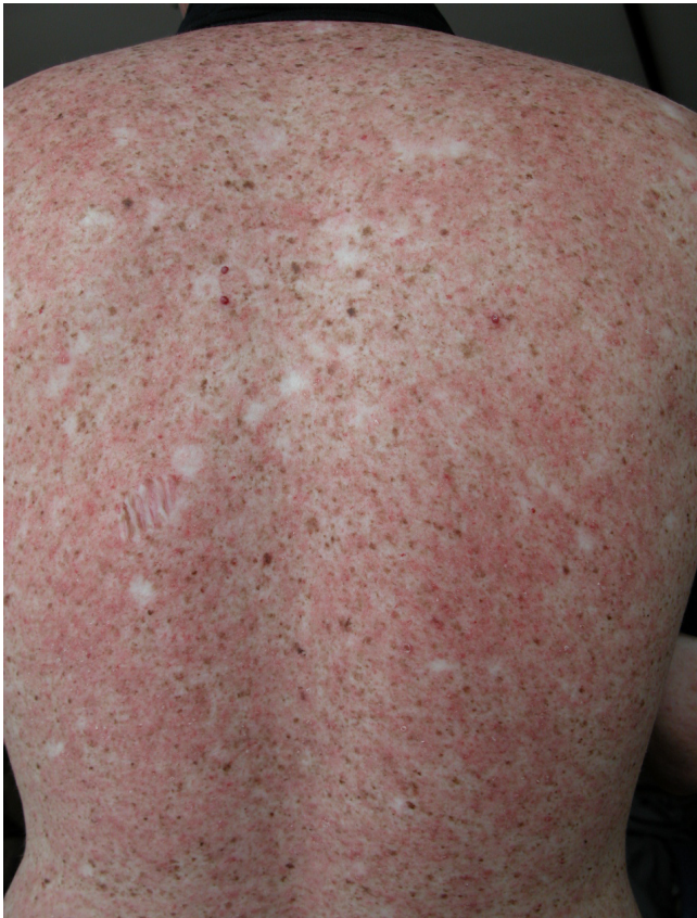
Figure 1 Association of small erythematous scaly plaques with multiple areas of hyperpigmentation resembling freckles on the patient's back.