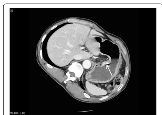
Figure 2 An axial computational tomography scan of the lesser curvature of the high body in the stomach. The fat plane is preserved. No lymphadenopathy is seen. Scan shows thickening (arrow) and mucosal enhancement.