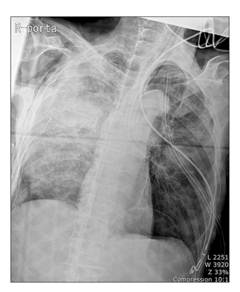
Fig. 3. Chest anteroposterior immediately after insertion of the chest tube shows re-expansion of the left lung.

Tension pneumothorax is an uncommon condition that can be fatal if left untreated [2]. Intraoperative tension pneumothorax can be extremely dangerous, especially during OLV and is a rare complication. It can cause sudden death or serious long-term organ damage. There exist a few case reports in the literature on contralateral tension pneumothorax