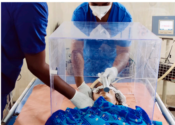
Fig. 1. Specially designed hood for intubation.

The number of diabetic ulcers presented to the emergency department was high compared to the previous years (Fig. 4). The degree of involvement of the limbs with ulcers ranged from Wagner's grade III to grade V, resulting in the increased number of major amputations like forefoot or below knee amputations to save the life of the individual. The limbs would have been salvaged if they came earlier.