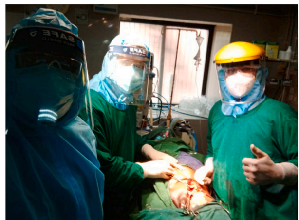
Fig. 2. Operating in full PPE.