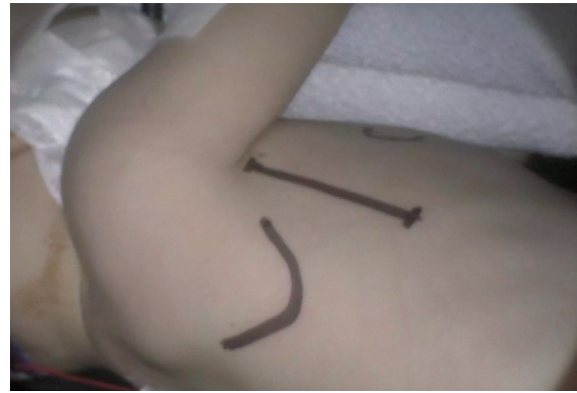
Figure 3 An intra-operative picture depicting patient positioning and important landmarks which are marked prior to skin incision, including the tip of the scapula, the future incision lying over the border of the latissimus dorsi muscle, and the nipple. The imaginary line connecting the nipple and the tip of the scapula represents the 4th intercostal space, which is the point of entry to the chest.