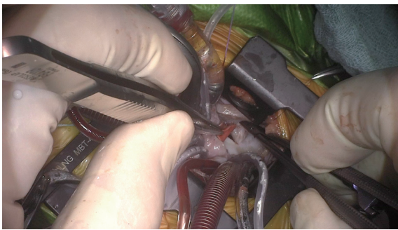
Figure 6 Intra-operative picture for a Ventricular Septal Defect repair using a Dacron patch, showing anchoring of the patch on the inferior defect border after detachment of the anterior leaflet of the tricuspid valve.

ventricular dysfunction have been achieved with induced VF times of up to 45 minutes.