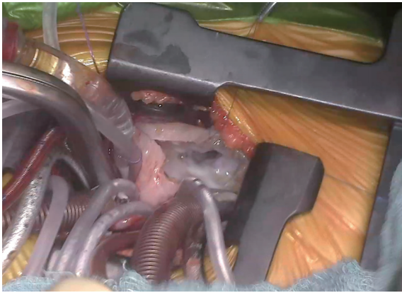
Figure 5 Exposure after right atriotomy with traction sutures on the tricuspid valve annulus at 9, 12, and 3 o'clock, providing better exposure for defect repairs.