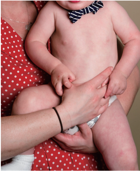
Figure 1 The post-operative cosmetic appearance leaving a scarless front chest, and an almost invisible short incision tucked away underneath the resting right arm. Permission to reproduce the image was given by the patient's parents.