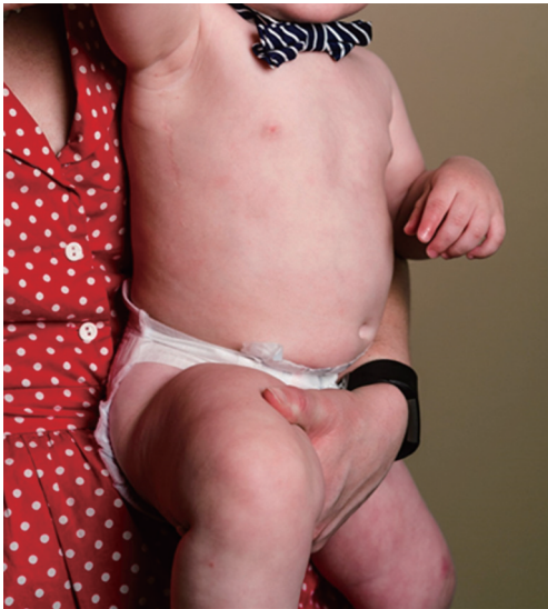
Figure 2 The post-operative cosmetic appearance of the short axillary incision, which would be hidden by the resting right arm. Permission to reproduce the image was given by the patient's parents.