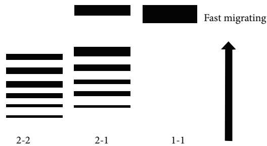
FIGURE 2: Typical electrophoresis patterns of haptoglobin proteins according to their genotypes. Hp 1-1 shows a fast migrating band corresponding to the small Hp 1 dimer, and Hp 2-2 displays multiple slow migrating bands representing polymers consisting of Hp 2 proteins. Hp 2-1 has a fast migrating band and several slow migrating bands.

electrophoresis results is shown in Figure 2. Although these phenotyping methods have been used for a relatively long time and many studies have been conducted based on these methods, they require special equipment and experienced personnel to interpret the results. Furthermore, these techniques are not designed to detect patients harboring the Hp^{del} allele that is, they cannot discriminate true anaptoglobinemias from conditions of acquired undetectable haptoglobin levels.