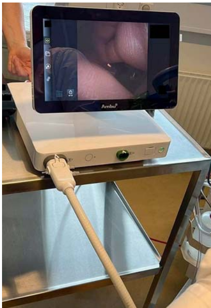
► Fig. 3 The aBox 2 unit with the single-use gastroscop connected to it.