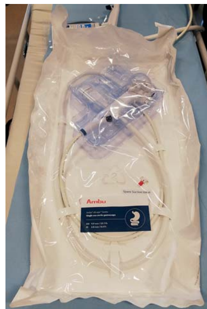
▶ Fig. 1 The aScope Gastro before unpacking.

▶ Video 1 Diagnostic esophagogastroduodenoscopy performed using the aScope Gastro. Use of the gastroscope is demonstrated. Biopsies are taken from the duodenum and antrum ventriculi. A hiatal hernia is visualized when looping in the stomach.