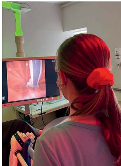
► Fig. 4 A diagnostic esophagogastro-duodenoscopy performed using the aScope Gastro.