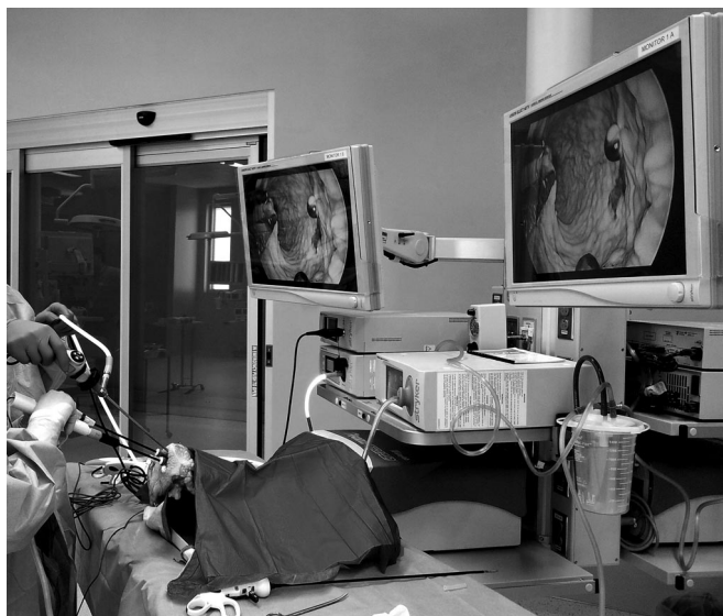
Figure 3. Simulated operative setup for TAMIS training.

dated the model, were available for proctoring participants until each task was completed successfully.