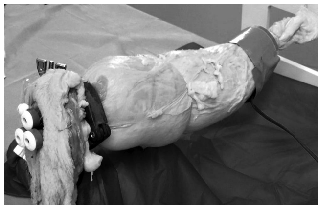
Figure 1. Completed porcine TAMIS model with the single-incision port in place.

Twenty community colorectal surgeons participated in the TAMIS training: no participants had prior training or experience in TAMIS. Participants were asked to perform various transanal excisions using the laparoendoscopic technique using the SILS port. They were required to lubricate and insert the SILS port transanally using gentle, manual pressure; achieve a pneumorectum; perform an endoluminal exploration; and finally excise various pseudopolyps using sheers, laparoscopic electrocautery, and laparoscopic harmonic devices.