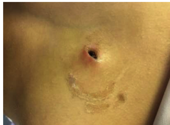
Fig. 2. Extrusion, view from patient's left.