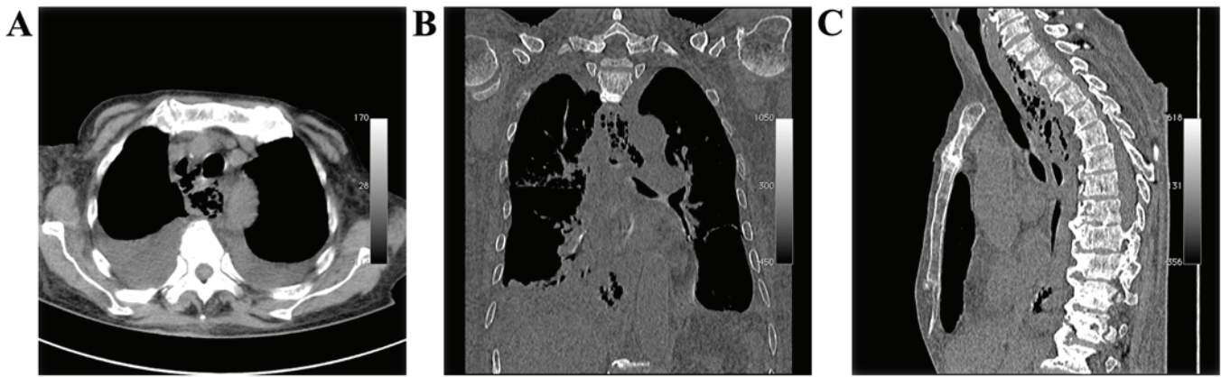
Figure 2. Cervical and chest computed tomography 2 days after admission. De novo gas formation extending to the cervical and retropharyngeal spaces down to the posterior mediastinum was indicated. (A) axial, (B) coronal and (C) sagittal view.