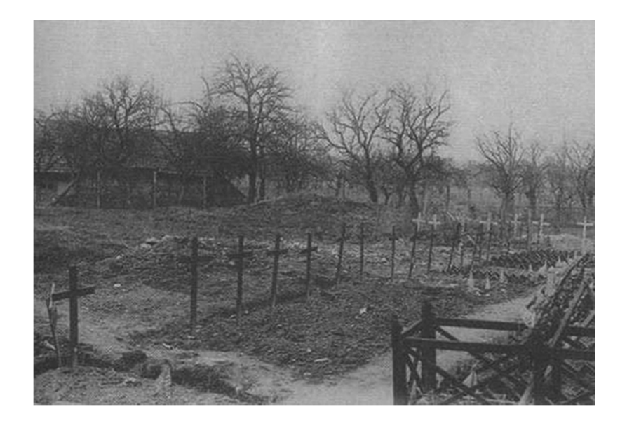
Figure 1. The 1918 pandemic caused so many deaths, so quickly, that in some hospitals bodies were stacked up layers deep; hasty burials, and burials in mass graves, were common.

But to complicate matters even further, out of the global reservoir of wild-bird IAVs that apparently gave rise to the 1918 pandemic virus have also emerged IAVs that infect other animals