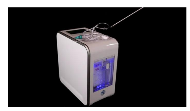
Figure 4: Ignited at output of nasal tube of AMS-H-03.

The ignition experiments at flow rate of 3 L/min, 2.5 L/min, and 2 L/min of hydrogen-oxygen gas (approximately 66% H_2 : 34% O_2 ) generated from the AMS-H-03 are performed. The AMS-H-03 is ignited at output of nasal tube, as shown in Figure 4 .