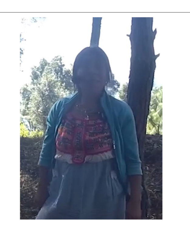
FIGURE 2 | Activity scale [target: Peak of kyqya<sup>C</sup> kcheq<sup>B</sup>].

There was also a strong effect of scale itself on the height of the pointing gestures. For targets at the activity scale, distance did prompt raising of the pointing arm, yet participants were more likely overall to point with a lowered arm. For district scale