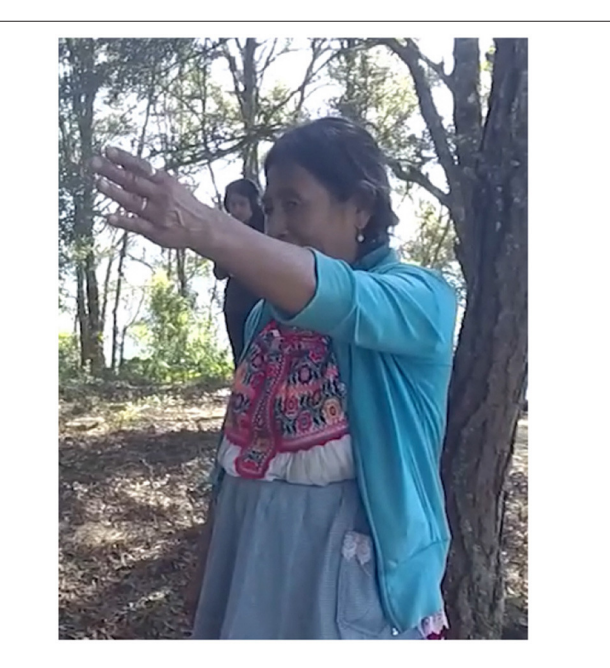
FIGURE 3 | District scale [target: ke<sup>A</sup> ku<sup>E</sup> suq<sup>C</sup>].

targets, participants were more likely to point with a raised arm, and likelier still to do so when indicating state scale targets. These findings are illustrated in the examples that follow.