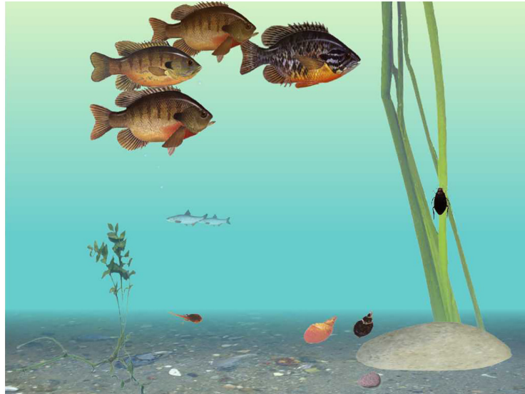
Fig 1. Sample experimental stimulus.