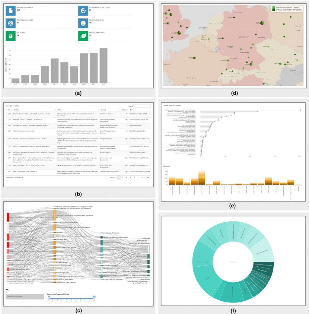
Fig. 3. Examples of dashboard elements for the visualization, summarization, and narration of findings. (a) Key indicators for aggregate statistics, e.g., number of relevant records, identified ecosystem services, number of records per year; (b) references, linked to the publication via its DOI; (c) Sankey chart for the summarization of variables, and an at-a-glance overview of relationships between the different categories of reviewed variables; (d) mapping of case studies in the form of a choropleth map combined with local chart signatures; (e) customizable summarizations; (f) use of various chart types across the dashboard, including, e.g., sunburst charts, that allow data drilling.

Finally, to promote transparency, the dashboard should enable a more immediate dissemination of findings. This is achieved in two ways: First, data is made accessible and retrievable. This is done, on the one hand, through providing a spreadsheet for download. This spreadsheet is one-hot encoded, i.e., data is provided in a normalized form, so that it can readily be used for querying and statistical analysis. On the other hand, a report document can be obtained that includes maps, charts, (cross-)tables, narrative elements, and references. This document is generated from a parameterized R Markdown report [30], so that the document content reflects the filtered data as selected by the user. Second, direct links through the DOI are by directly linking to the analyzed records via their DOI.